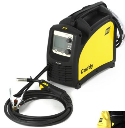
Supplied with shoulder strap.