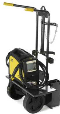
Trolley - for easier transport of gas cylinder and Caddy® Mig.