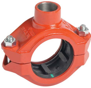
Female Threaded Outlet