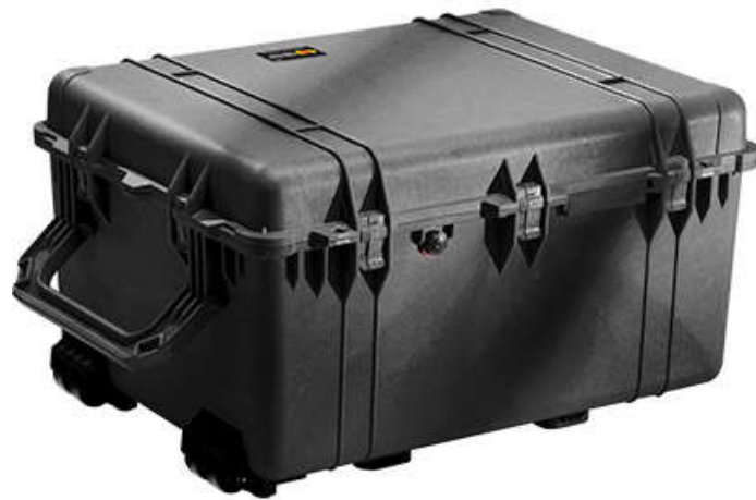
1630 Protector Transport Case

(/us/en/product/cases/mobility-case/protector/1620m)