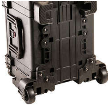
1620M Protector Mobility Case

(/us/en/product/cases/mobility-case/protector/1620m)