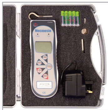
AFG and accessories