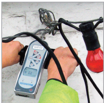
Pull test on anchorage points