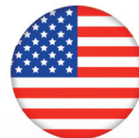
Assembled in the USA

Mecmesin reserves the right to alter equipment specifications without prior notice