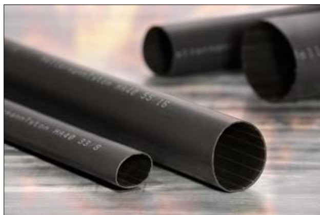
HA40 thick wall, adhesive lined and flame retarded tubing for shipbuilding applications.