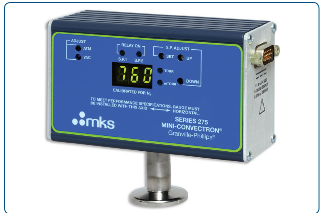
Display Side (Analog shown)