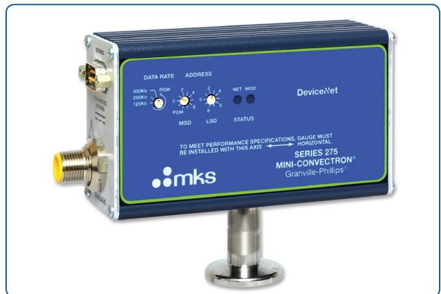
Parameter Adjustment Side (DeviceNet shown)