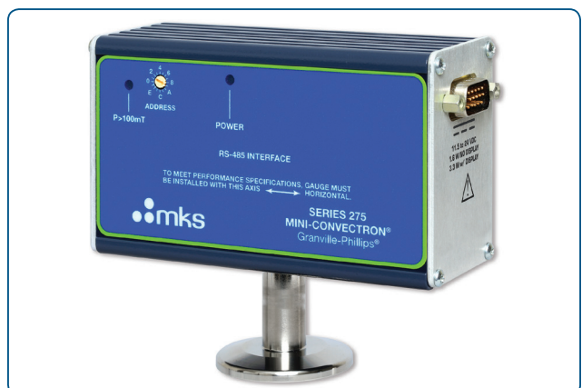
Parameter Adjustment Side (RS485 shown)