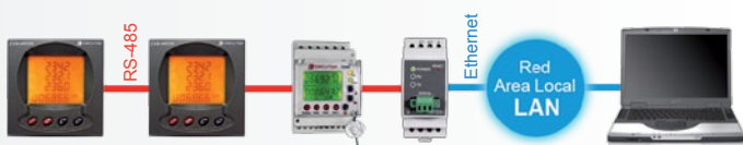
Fig. 1. Master-slave standard function

TCP2RS+ es el único conversor del mercado con alimentación multi-rango (85...290 Vc.a. / 120...410 Vc.c.) y fijación a carril DIN en tan sólo 2 módulos.